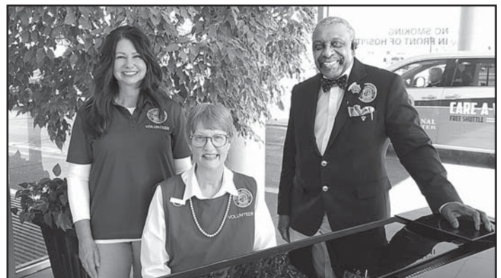
Volunteers gather at the piano in MRMC's main lobby.

If you or someone you know would be interested in volunteering at one of Maury Regional Health's campuses, encourage them to visit MauryRegional.com/Volunteer to learn more.