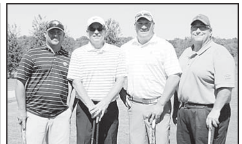
THE STERIS TEAM