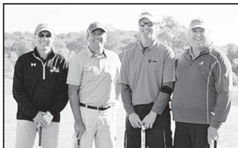
THE TRANE TEAM