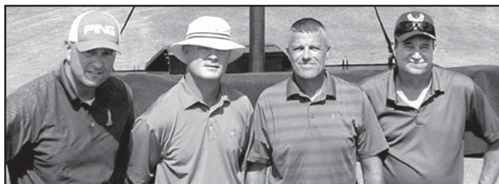
CINTAS CORPORATION TEAM