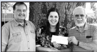
The Maury County Gun Club hosted the annual Shoot for a Cure event in May, raising $6,363 for the Maury Regional Health Care