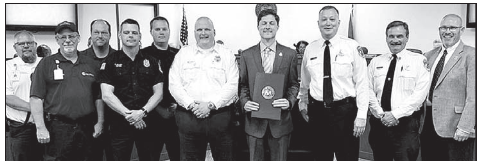
The city of Columbia proclaimed May 19-25 an official observation of Emergency Medical Services (EMS) Week during the May meeting of the City Council. Members of the council also recognized (pictured) Maury Regional EMS and Columbia Fire & Rescue for their service to the community.