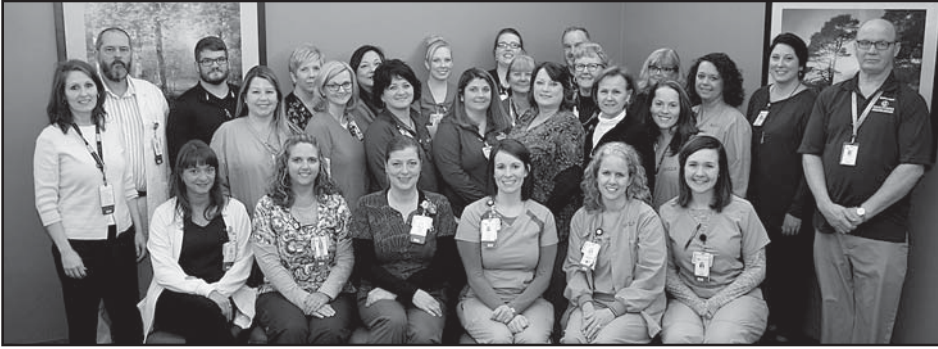
Members of the Patient Huddle Team are pictured above.