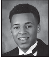
Nygil Arms Columbia Academy Georgia Arms, Mother/Baby Unit